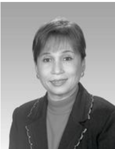
ALEXIS M. HERMAN

Mr. Deutch has been an Institute Professor at the Massachusetts Institute of Technology since 1990. He joined the MIT faculty in 1970 and served as Dean of Science from 1982 to 1985 and Provost from 1985 to 1990. Mr. Deutch received a B.A. in History and Economics from Amherst College in 1961; and a B.S. in Chemical Engineering in 1961 and Ph.D. in Physical Chemistry in 1965, both from MIT. While on leave from his current post at MIT, Mr. Deutch served as Director of Central Intelligence during 1995 and 1996. From 1994 through 1995 he was U.S. Deputy Secretary of Defense and also served as Undersecretary of Defense for Acquisition and Technology between 1993 and 1994. He was Director of Energy Research and Undersecretary of the U.S. Department of Energy during the Carter Administration. He is a Director of Citicorp, CMS Energy, Raytheon Corporation, and Schlumberger, and is also a Trustee of Resources for the Future, the Urban Institute and Director of the Council on Foreign Relations.