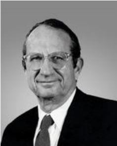
JOHN M. DEUTCH