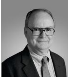
WILLIAM D. RUCKELSHAUS