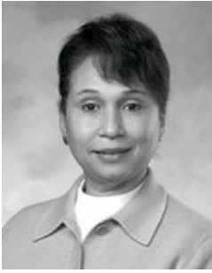
ALEXIS M. HERMAN