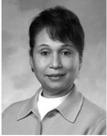
ALEXIS M. HERMAN

Mr. Deutch has been an Institute Professor at the Massachusetts Institute of Technology since 1990. He joined the MIT faculty in 1970 and served as Dean of Science from 1982 to 1985 and Provost from 1985 to 1990. Mr. Deutch received a B.A. in History and Economics from Amherst College in 1961; and a B.S. in Chemical Engineering in 1961 and Ph.D. in Physical Chemistry in 1965, both from MIT. While on leave from his current post at MIT, Mr. Deutch served as Director of Central Intelligence during 1995 and 1996. From 1994 through 1995 he was U.S. Deputy Secretary of Defense and also served as Undersecretary of Defense for Acquisition and Technology between 1993 and 1994. He was Director of Energy Research and Undersecretary of the U.S. Department of Energy during the Carter Administration. He is a Director of Citicorp, Raytheon Corporation, and Schlumberger, and is also a Trustee of Resources for the Future, the Urban Institute and an Overseer of the Museum of Fine Arts, Boston.