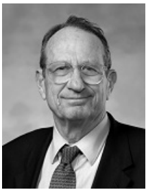
JOHN M. DEUTCH

Mr. Deutch has been an Institute Professor at the Massachusetts Institute of Technology since 1990. He joined the MIT faculty in 1970 and served as Dean of Science from 1982 to 1985 and Provost from 1985 to 1990. Mr. Deutch received a B.A. in History and Economics from Amherst College in 1961; and a B.S. in Chemical Engineering in 1961 and Ph.D. in Physical Chemistry in 1965, both from MIT. While on leave from his current post at MIT, Mr. Deutch served as Director of Central Intelligence during 1995 and 1996. From 1994 through 1995 he was U.S. Deputy Secretary of Defense and also served as Undersecretary of Defense for Acquisition and Technology between 1993 and 1994. He was Director of Energy Research and Undersecretary of the U.S. Department of Energy during the Carter Administration. He is a Director of Citicorp, Raytheon Corporation, and Schlumberger, and is also a Trustee of Resources for the Future, the Urban Institute and an Overseer of the Museum of Fine Arts, Boston.